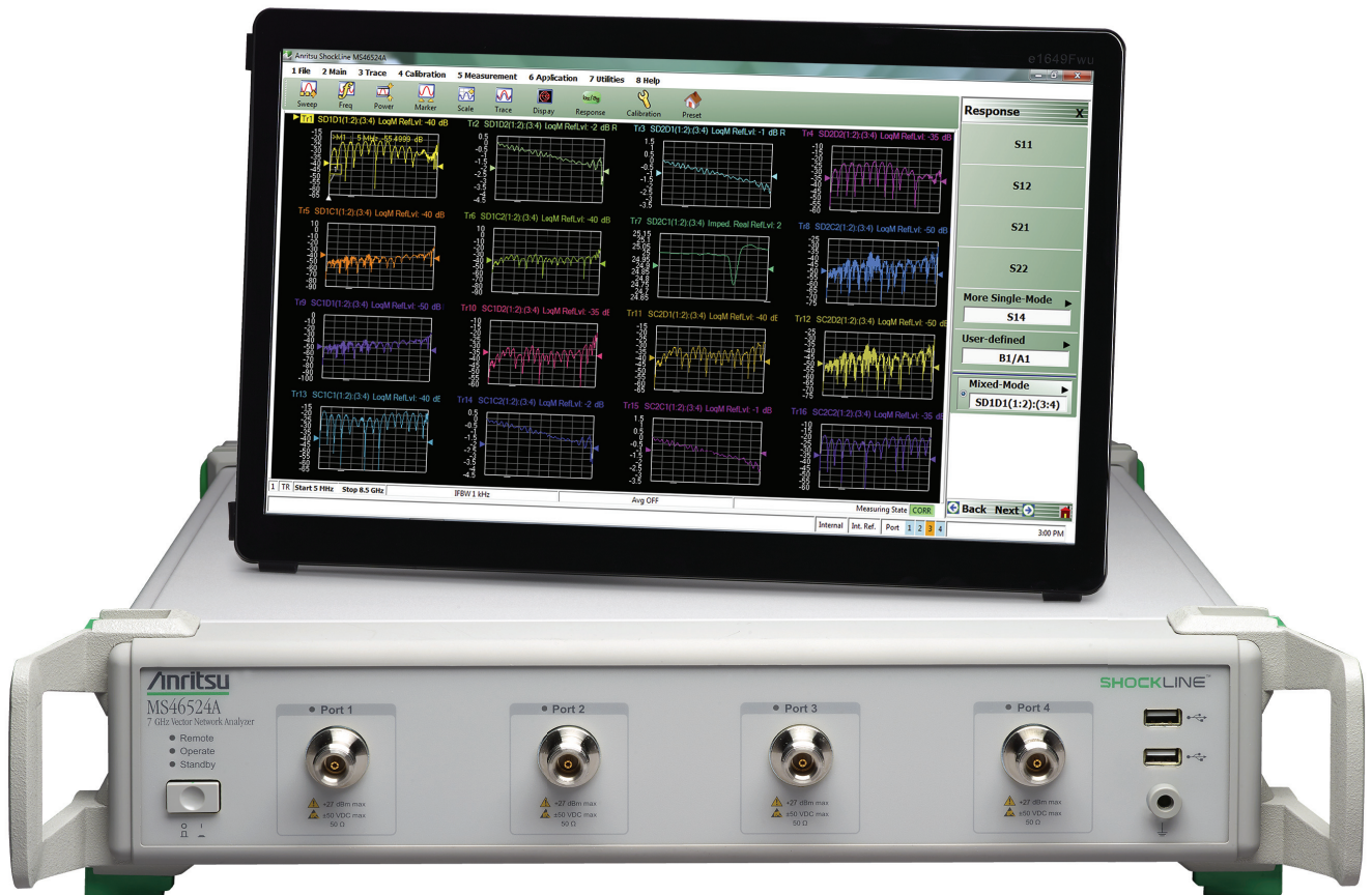
MS46524A-007 4-Port ShockLine™ VNA