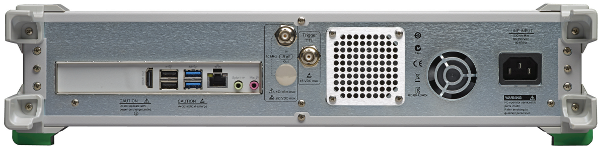
MS46524A-007 Rear Panel