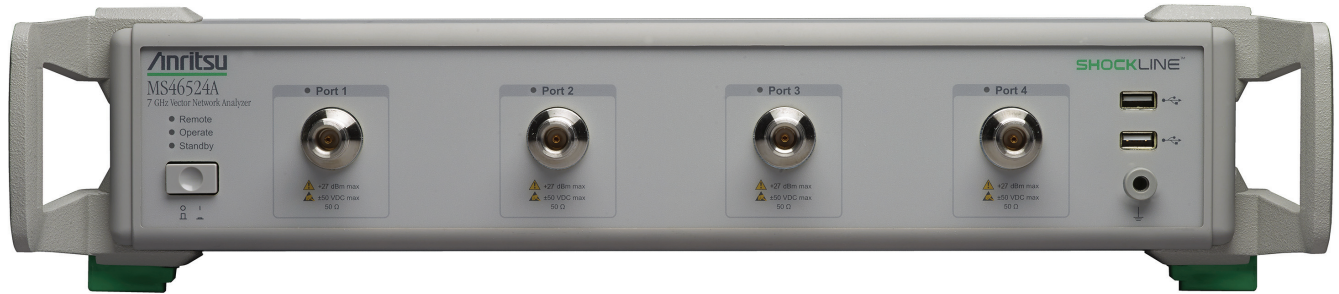
MS46524A-007 Front Panel